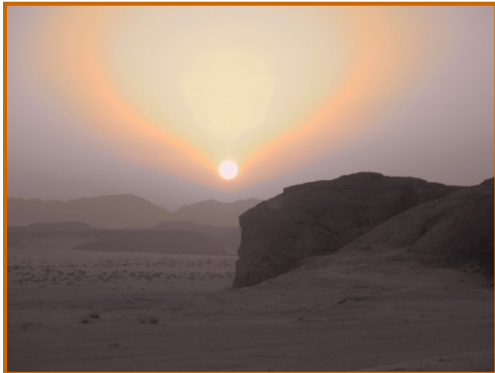
Sunrise in the Sinai Desert

For nine days of Pilgrimage into Desert Spirituality Sinai Desert, Egypt – Petra, Jordan